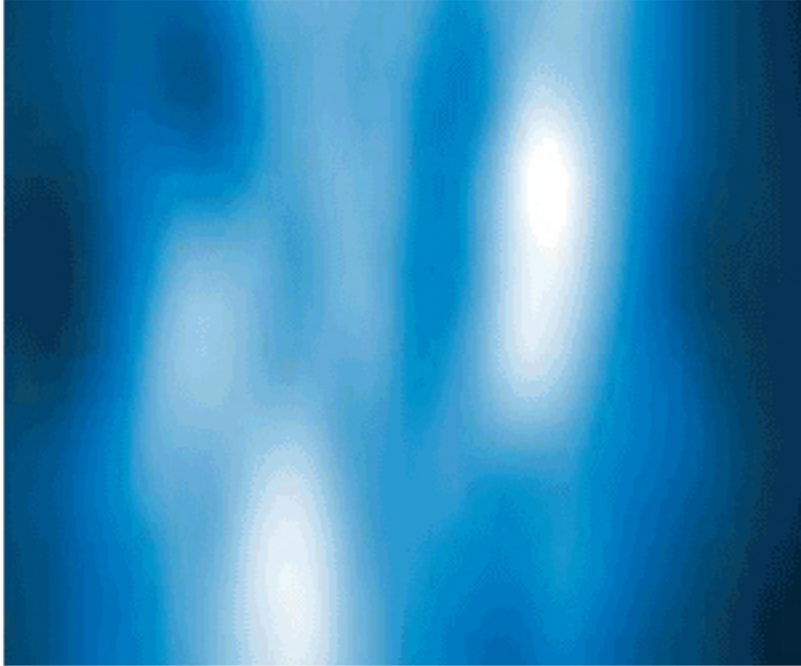
System Sensor: SIW's Fire and Life Safety Section Sponsor

Home > root level > Digital Ally video surveillance via mobile phone expanded